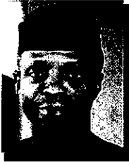
His Excellency Yemi Osinbajo GCON Vice President, Federal Republic of Nigeria