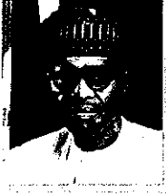
His Excellency Muhammadu Buhari GCFR President, Federal Republic of Nigeria