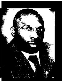
Yemi Kale Statistician General, National Bureau of Statistics