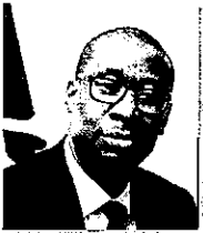
Honourable Minister Okechukwu Enelamah Minister of Industry, Trade and Investments